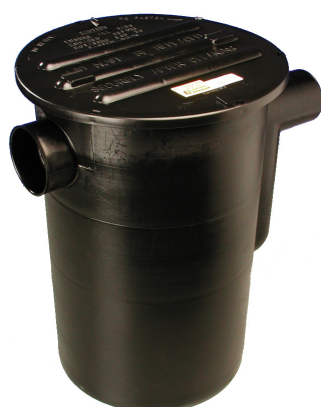
45L polymer grease trap

The polymer trap has a strong, durable, polypropylene cover with child-resistant locking tabs. An optional Concrete cover is available, and this type is standard for the Concrete Traps. Risers are also available for all types. Note that all these units are intended for residential property and are not intended for installation in areas exposed to regular pedestrian traffic or to any form of vehicular traffic.