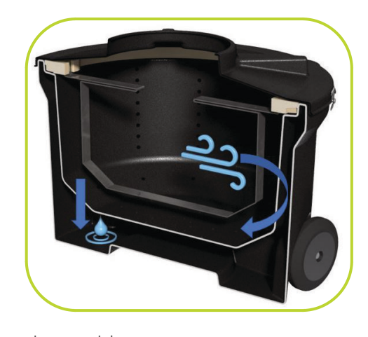
C. Compost Mixer accelerates the composting process & increases the useable space.